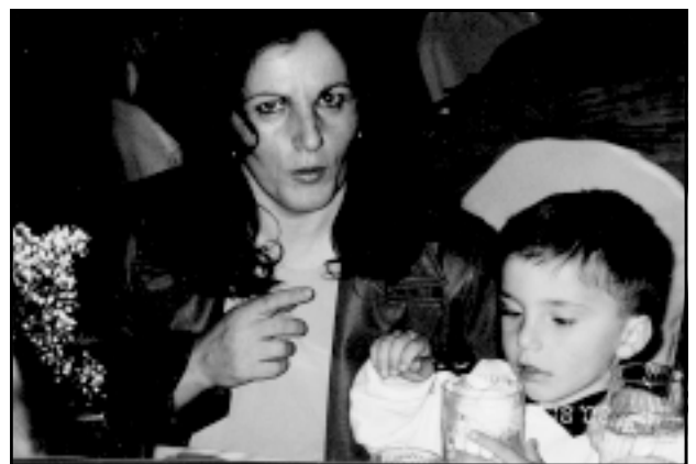
Little Albanian boy and his mom are guests at Valentine's Day Dinner Dance